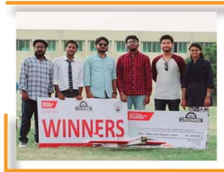
Team "Shaheen" from College of Engineering was declared "Champions" of PropellAir-19 held at NED-University, Karachi.