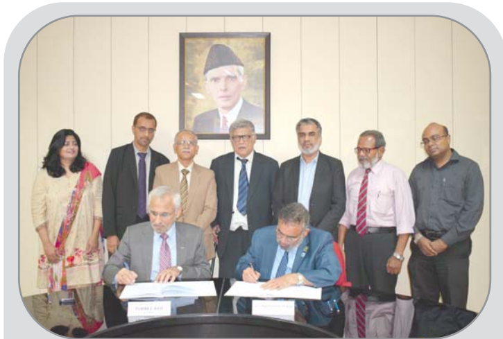
MoU signed between KIET and KCCI which shall help in establishing strong linkages between industry and academia to improve their capacity to respond to social and economic challenges.

KIET has successfully established a culture of research and is leading the private sector universities in Sindh by winning an accumulated research grant of over Rs 110.0 Million in recent years with many more research project proposals in the pipeline.