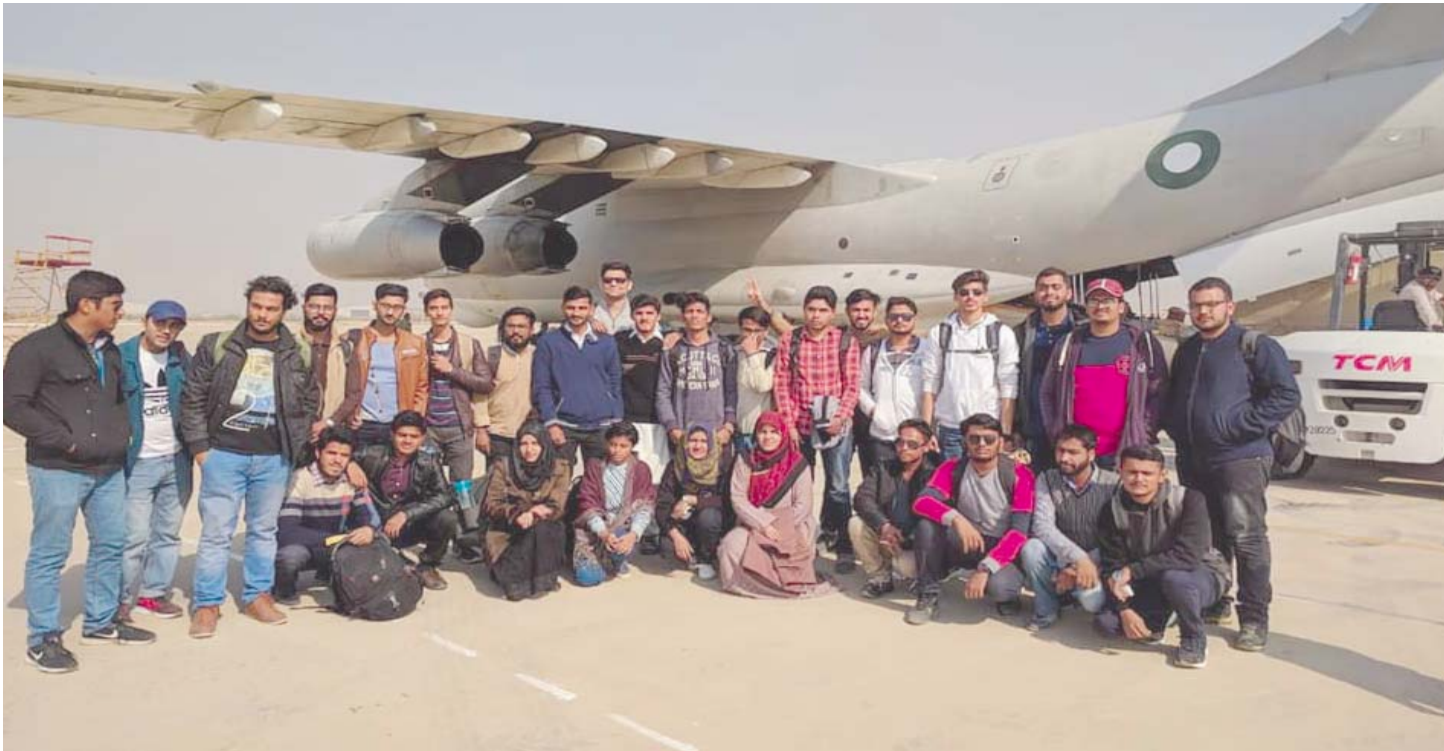
College of Engineering students benefit for internship at Pakistan Aeronautical Complex (PAC), Kamra besides being facilitated by free air travel, courtesy Pakistan Air Force.

Provisional admissions shall be given to all candidates fulfilling the merit requirements and will be confirmed as soon as the result declared or concrete decision announced by the relevant Government body. The provisional admission shall stand cancelled forthwith if a candidate fail to attain the requisite percentage in the last academic examination and any refund of the fee would be in accordance with "HEC National Policy on Fee Refund".