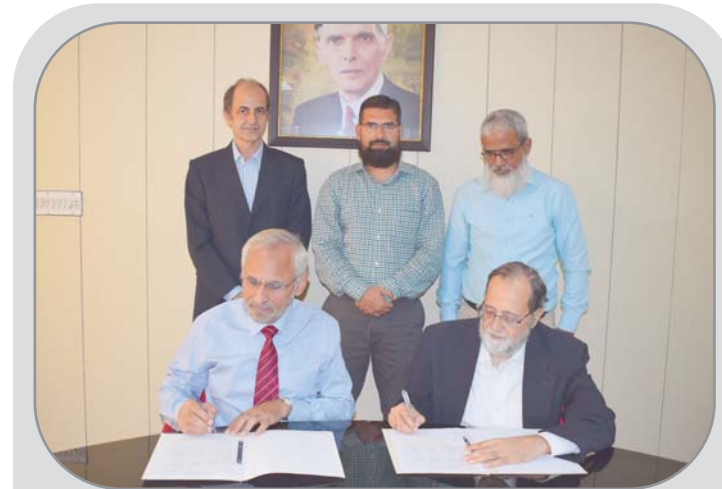
MoU signed between KIET and DATALOG to develop a "Low Cost Air Quality Monitoring System with Smart Dashboards"