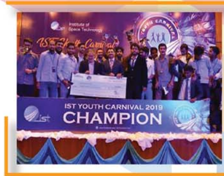
KIET declared as IST Youth Carnival 2019 Champions in 12th All Pakistan IST Youth Carnival (IYC) held at Institute of Space Technology, Islamabad.