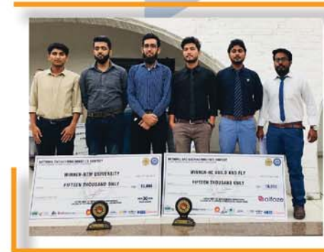
"Winners of 17th Annual National Engineering Robotics Contest (NERC 2019) organized by NUST College of Electrical & Mechanical Engineering (CEME), Islamabad, STEM Careers Program HEC and National Centre of Robotics & Automation (NCRA) at CEME."