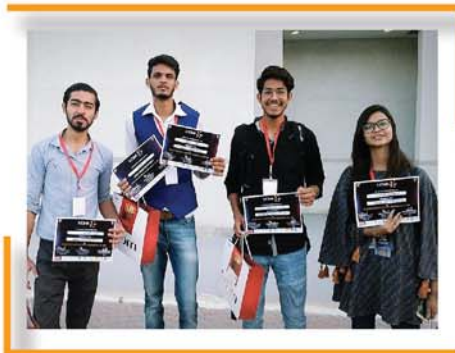
Team from KIET won 2nd Position at IBA Branding & Advertising Conference (IBAC 5.0) held at IBA Karachi.